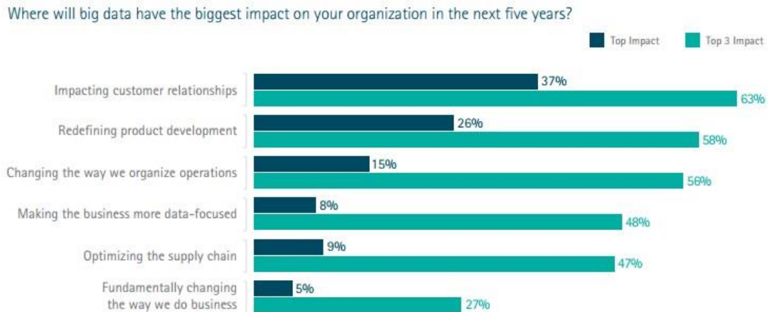
Figure 1 Impact from Big Data in the next five years.

It would also be interesting to see where analytics (big data, specifically) is being deployed and the direction ahead.